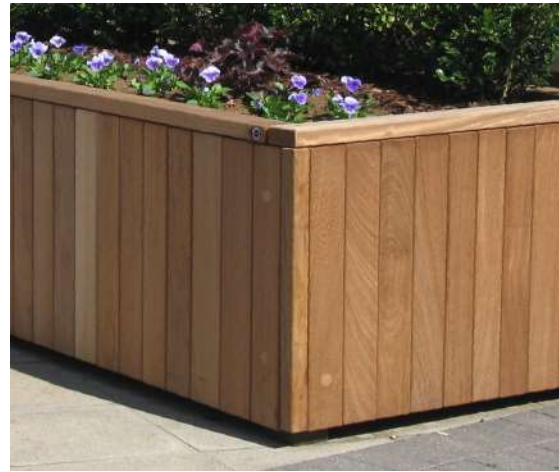
Section thro' planter

The internal base is constructed using 100x47mm sawn treated softwood bearers, fixed to the posts and fitted to joist hangers fixed to the main bearers. Plywood sheeting is fixed down onto the bearers. 45mm high timber blocks are fitted to the underside of the bearers, to ensure that the load is safely transferred to the ground. When fully constructed, the inside of the planter is fully lined with a geo-textile lining, that allows water to drain through whilst retaining the soil fines.