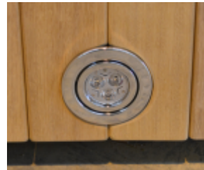
Side lighting - holes are cut into the side walls of the planter to allow LED spot lighting to be fitted.