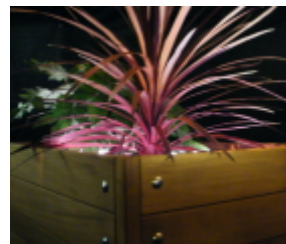
Plant lighting - LED lights are supplied to illuminate and make features of the planting