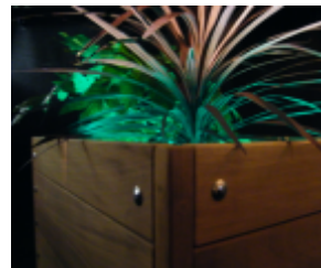
Up lighting - LED up lighting is fitted to the inside top of the planter, creating a rim of light between the planting and the planter