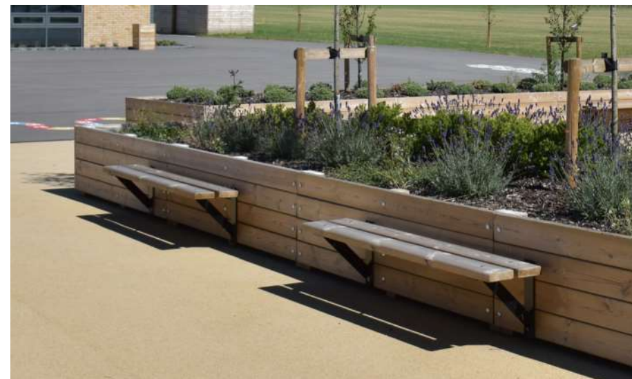
Henley planter benches

staple, to allow the residents to make their storage box secure. When closed the lid of the storage boxes can be used as an informal bench or table top. The storage boxes can be manufactured to match the planters, the storage boxes can be manufactured in FSC®-certified treated redwood or FSC®-certified hardwood.