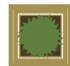
bench on 4 sides (mitred)