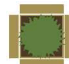
bench on 4 sides