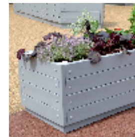
Optional RAL 7012 opaque stained finish

As an optional extra, FSC timber planters can be supplied with an opaque stained finish. Three coats of stain will be applied. If required, RAL colours can be specified.