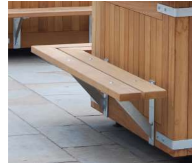
Kensington planters with optional Henley planter benches with galvanised support brackets

UK Street Furniture Designers & Manufacturers