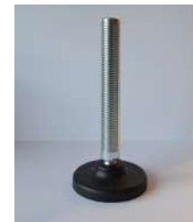
M30 adjustable foot