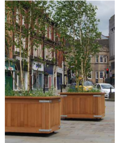
Kensington planters with optional tree anchor fittings and adjustable feet