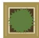
bench on 4 sides (mitred)