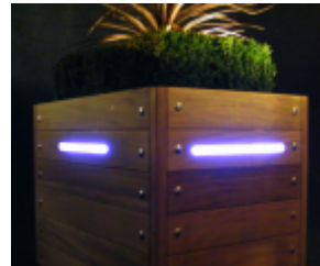
Side lighting - holes are manufactured into the side walls of the planter to allow the LED lighting to create a decorative feature to the sides of the planter