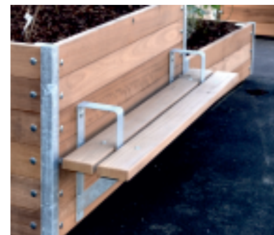
Optional Henley planter bench