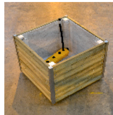
Optional Mona tank watering system

Integral planter benches, with or without armrests, can be supplied with Mews planters. As standard 2 bench designs are available. Other designs can be included upon request. The Bexley bench consists of 4 no. 70x45mm timber slats and the Henley bench has 2 no. 145x45mm wide bench slats. The timber slatted benches bolt onto galvanised mild steel brackets, attached to the planter sides. Benches can be fitted to 1, 2, 3 or 4 sides to suit your requirements. The choice of material and finish is the same as for the planter. As standard the brackets will have a galvanised finish. As an optional extra, they can be polyester powder coated.