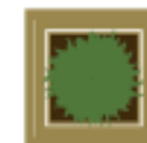
bench on 4 sides (mitred)