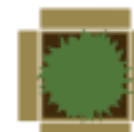
bench on 4 sides