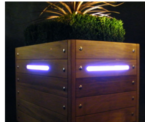
Side lighting - holes are manufactured into the side walls of the planter to allow the LED lighting to create a decorative feature to the sides of the planter