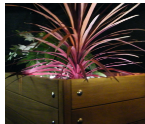
Plant lighting - LED lights are supplied to illuminate and make features of the planting