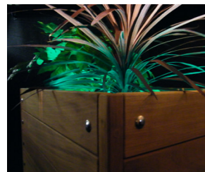
Up lighting - LED up lighting is fitted to the inside top of the planter, creating a rim of light between the planting and the planter