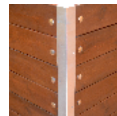
Optional grey stained finish

As an optional extra, the FSC treated redwood can be supplied with a stained finish. This will be applied after the timber treatment process. The standard stain will be 3 coats of Ronseal quick drying water based stain. The standard colour will be teak. Other stains and colours can be applied upon request.