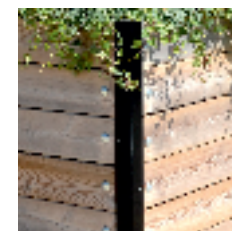
Optional polyester powder coated finish

After fabrication and hot dip galvanising, the 60x60mm angle corner brackets can be polyester powder coated. They can be powder coated to any RAL colour depending on product quantity and stock levels of powder colours. Depending on stock levels the powders are available in 3 gloss levels; gloss, satin and matt.