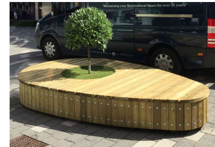
Swithland Island planter/seating unit