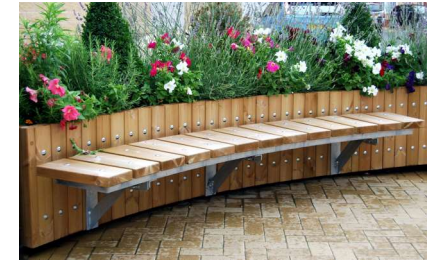
Swithland curved planter with Spalding curved planter bench

Integral planter benches, with or without armrests, can be supplied with Swithland planters. As standard 2 bench designs are available. Other designs can be included upon request. The Bexley bench consists of 4 no. 70x45mm timber slats and the Spalding bench has 145x45mm wide bench slats, which run from back to front. The slatted benches bolt onto galvanised mild steel brackets, attached to the planter sides. Benches can be fitted to 1, 2, 3 or 4 sides to suit your requirements. The choice of material and finish is the same as for the planter. As standard the brackets will have a galvanised finish. As an optional extra, they can be polyester powder coated.