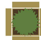
bench on 4 sides