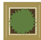
bench on 4 sides (mitred)