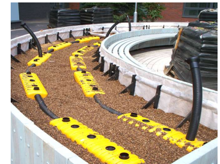
Planter ready for soil and planting