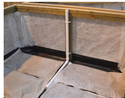
Hydroleca sacks laid out in base of planter