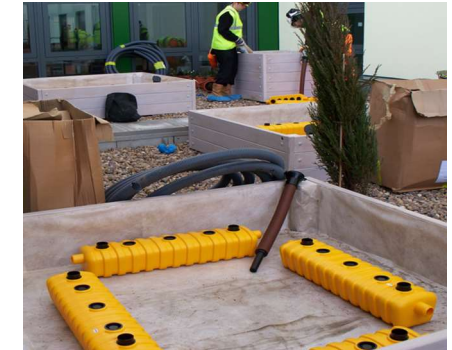
Water storage tanks and filler pipe

For full details visit: www.green-tech.co.uk