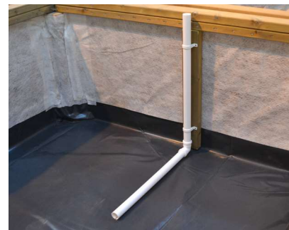
Polythene liner with filler pipe