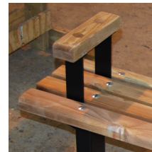
Bexley bench - with optional Type 2 armrest, in natural FSC treated redwood with galvanised and powder coated armrest.