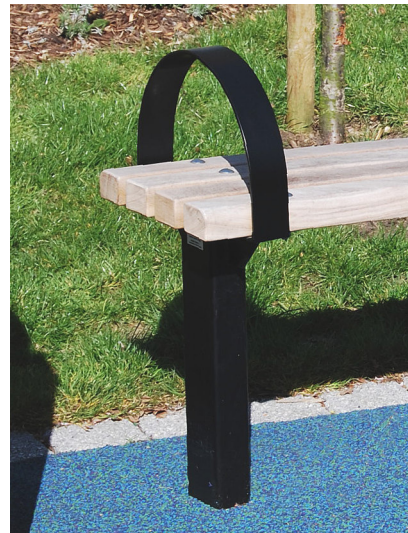
Bexley bench - with armrest, in natural FSC iroko hardwood with galvanised and powder coated bench leg.