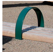
Bexley bench - with optional intermediate armrest, in natural FSC iroko hardwood with galvanised and powder coated armrest.