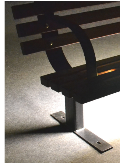
Bexley seat - with optional, white LED lighting fitted to the underside of the timber slats.