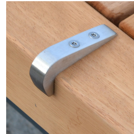
Bexley seating - anti-skateboard fittings, in dull polished stainless steel, fixed to natural iroko hardwood slats.