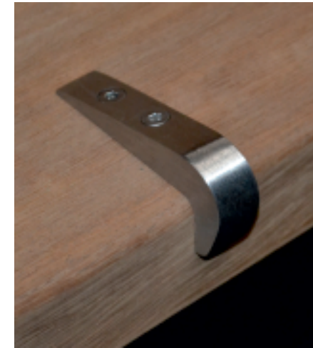
Optional anti-skateboard fitting